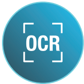
Optical Character Recognition

Higher Duty Cycles and Periodic Maintenance Intervals provide greater volume with fewer routine service calls so you can stay focused on productivity.