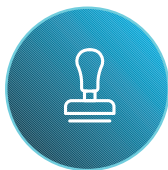
Annotation & Bates Stamping